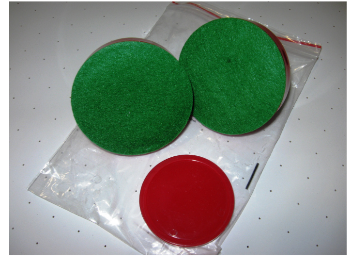
3" dia. green felt is adhered to the bottom of each striker.

Packaged: 2 of each in 10" x 6.5" self-sealing poly-bag