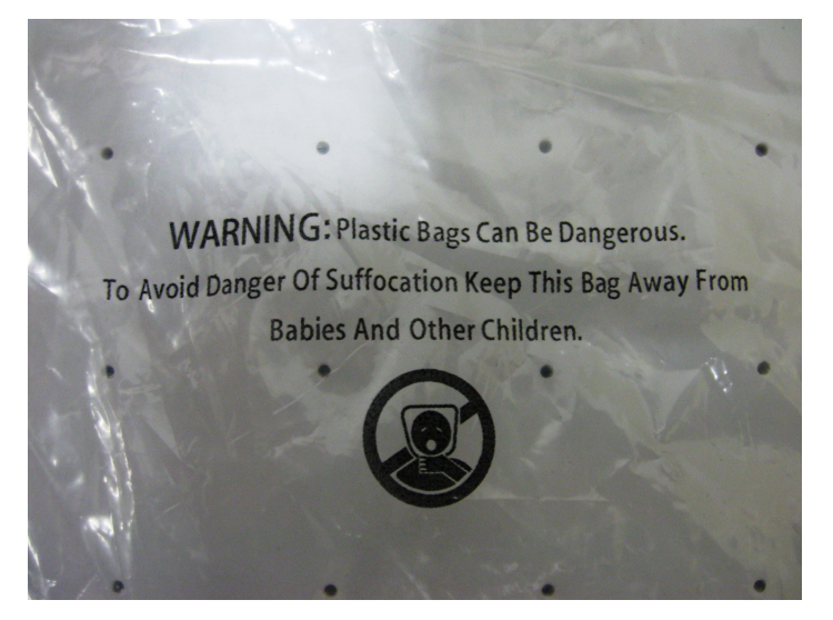
Poly-bag must be imprinted with "Suffocation Warning" on outer surface with black ink.

All dimensions given are approx. and represent the size at the widest point of that dimension.