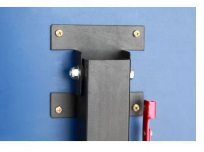
Leg Frame is 1.5" sq. silver powder coated corrosion resistant heavy gauge tube steel.

Table must meet INTERNATIONAL TABLE TENNIS FEDERATION (ITTF) standards.