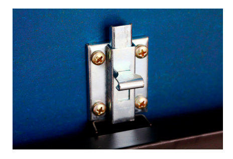
Locking safety mechanism should meet US & European standards.