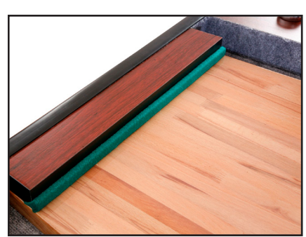
20" W x 1.125" H x 3.5" D rebound cushion is made of gum rubber covered in green blended polyester/wool cloth