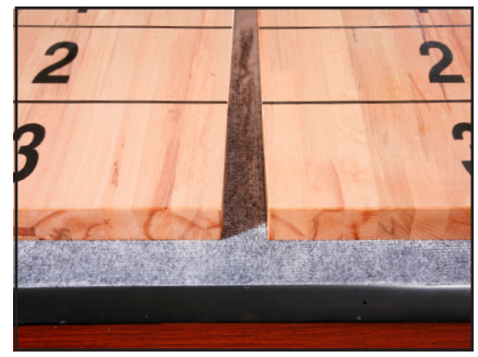
2.75" deep gutters are covered, bottom and sides, with grey, synthetic fiber, ribbed carpeting.