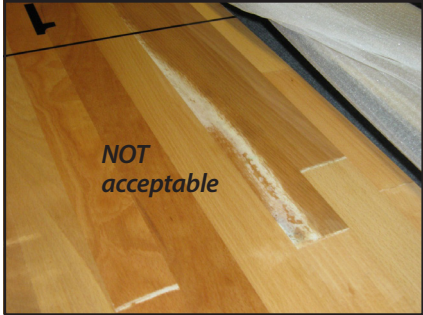
Play surface must be smooth and level with NO dips over 1/32" in depth and NO visible filler (see photo above).