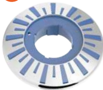
Stainless Steel Color Accent