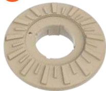
Full Color Plastic