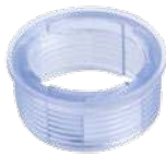
Clear Flush Fitting