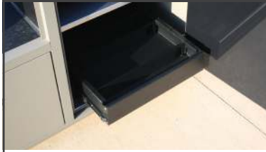
Universal Floor-Mount Drawer

Available on all Torch models. (16"W x 21"D)