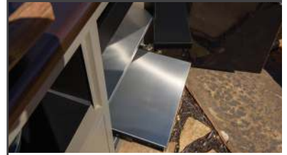
Universal Floor-Mount Slide-Out Shelf Available in two depths.

Available on all Torch models. (16"W x 21"D)