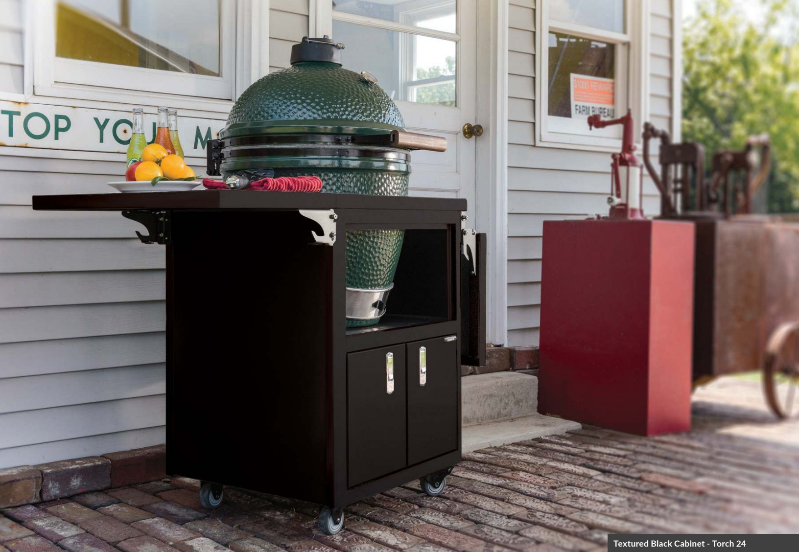
Textured Black Cabinet - Torch 24