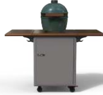
Torch Table Top