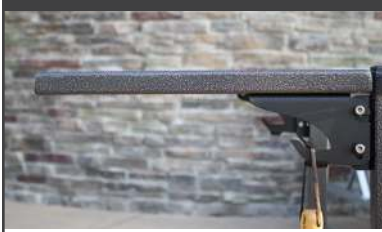
Flip-Up* or Stationary Counter

Available on Torch 48, 54, 76. *Flip-up requires factory install.