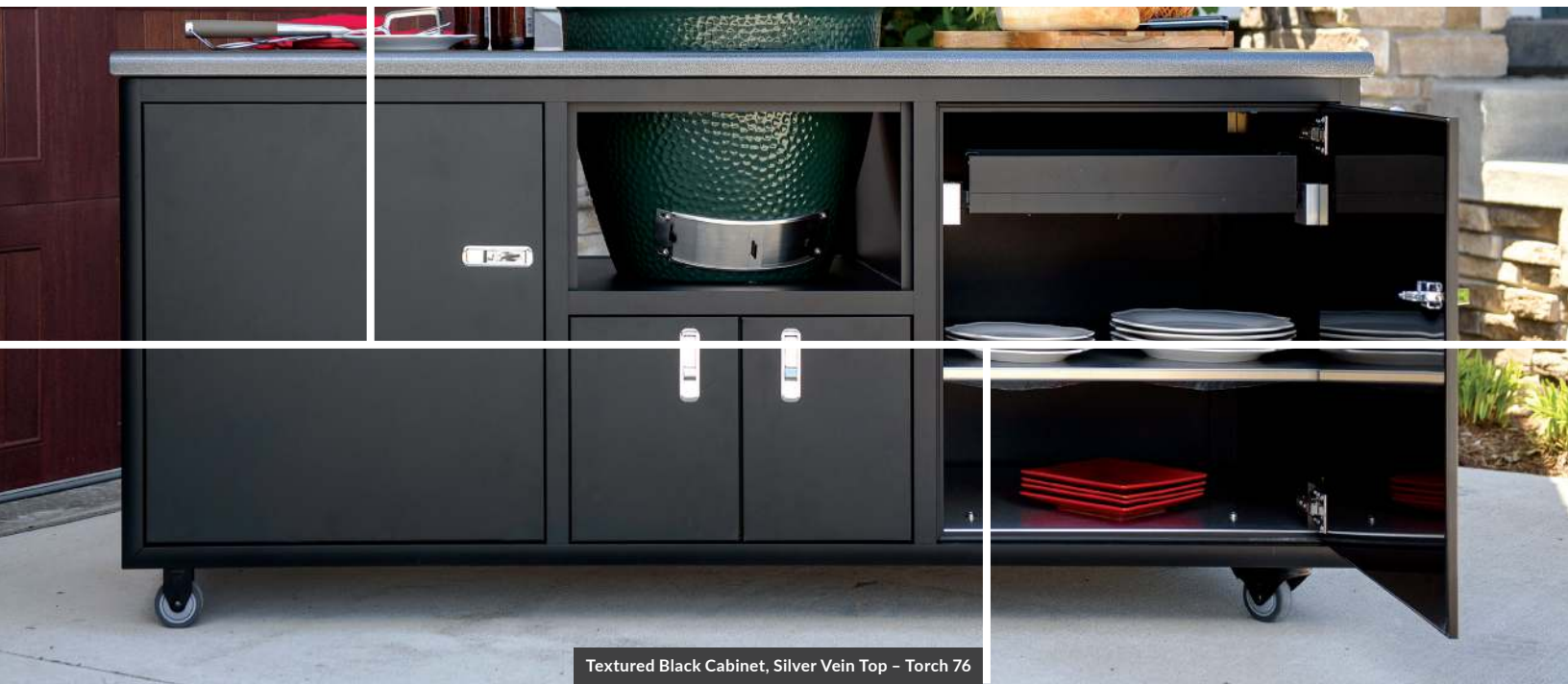
Textured Black Cabinet, Silver Vein Top - Torch 76