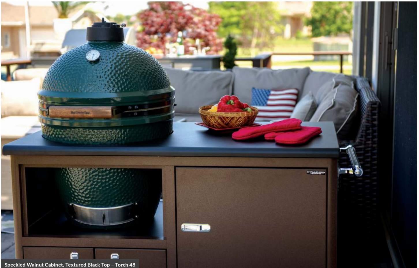
Speckled Walnut Cabinet, Textured Black Top – Torch 48