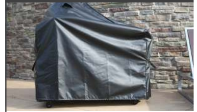
Aqualon (Marine Grade) Cover