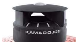
Kontrol Tower Top Vent