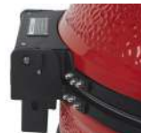
Air Lift Hinge