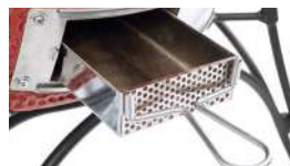
Slide-Out Ash Drawer