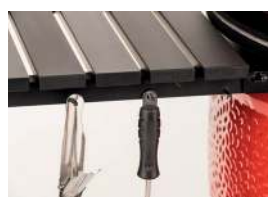
Aluminum Side Shelves