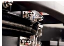
Stainless Steel Latch