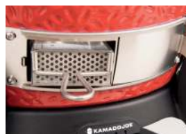
Patented Ash Collector