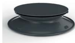
Patented Hyperbolic Insert