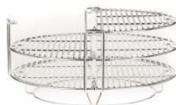
Divide & Conquer® System