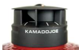
Kontrol Tower Top Vent