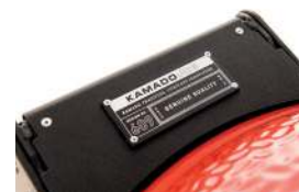
Air Lift Hinge