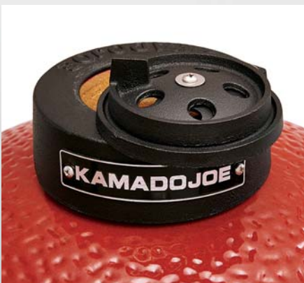
Dual-disc top vent lets you control cooking temps two ways