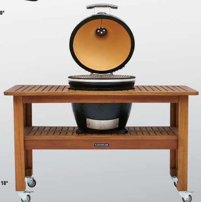
Black Classic Stand-Along 18" in eucalyptus grill table