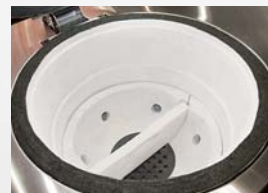
Fire box divider for higher fuel efficiency or to create separate cooking zones