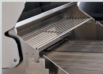
Both models feature two grill burners, one back burner, one sear burner and ample cooking area