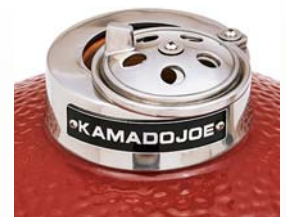
Stainless steel dual-disc top vent