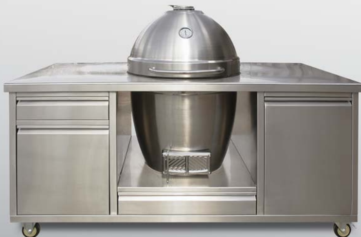
Pro Joe with optional cart offering three accessory drawers and charcoal storage