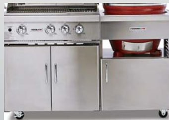
Combo Joe cart is made of 304 stainless steel and offers plenty of storage space