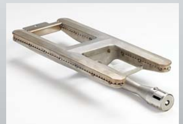
Combo Joe 36" Ultra features two premium, heavy-duty stainless steel cast burners