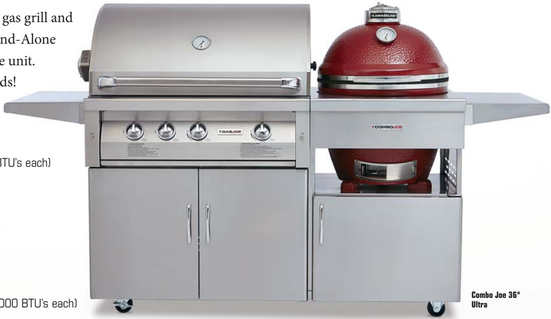
Combo Joe 36" Ultra