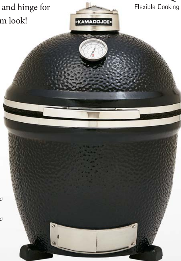
Black Classic Stand-Along 18"