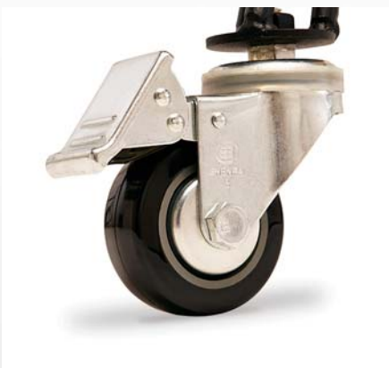
Oversized locking castor wheels for maneuverability and stability