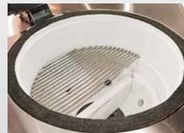
Two-piece design 3/8" 304 stainless-steel upper and lower cooking grates