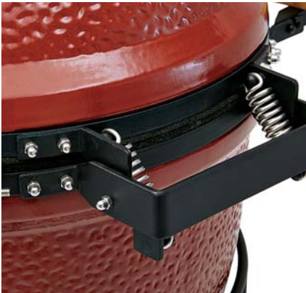
Powder-coated, galvanized iron hinge