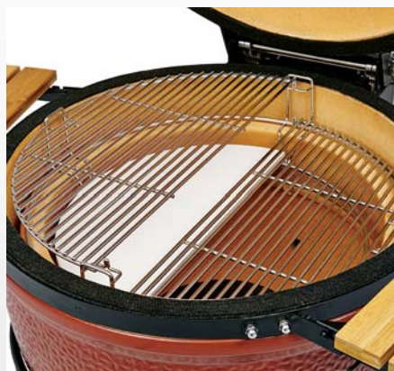
Divide & Conquer Flexible Cooking System for unmatched versatility