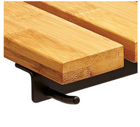
4 utensil pins on each side shelf for holding tools