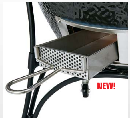
Slide-out ash drawer contains and controls messy ash