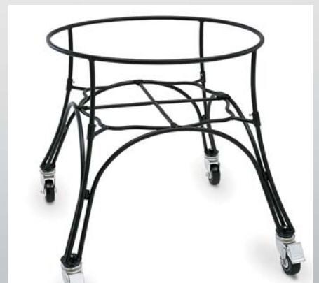
Heavy-duty grill stand