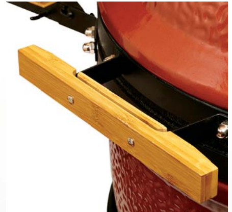
Finished bamboo handle