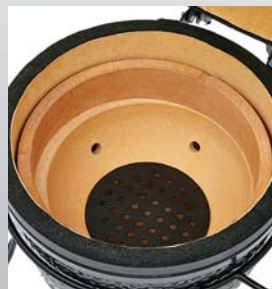
High-fire, heat-resistant ceramic