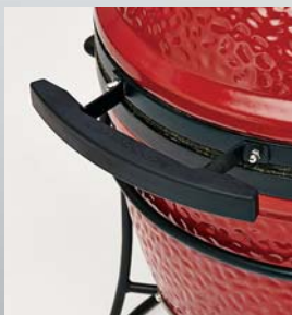
High-density polyethylene handle