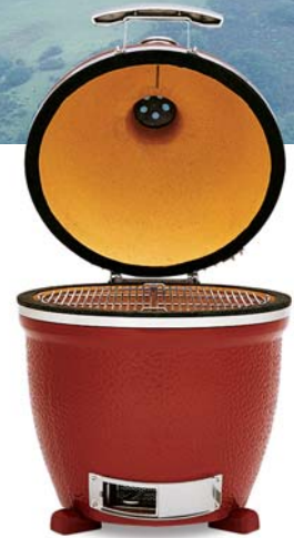
Red Classic Stand-Along 18"