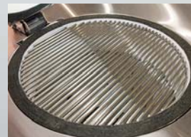
Upper cooking grate with both sections inserted