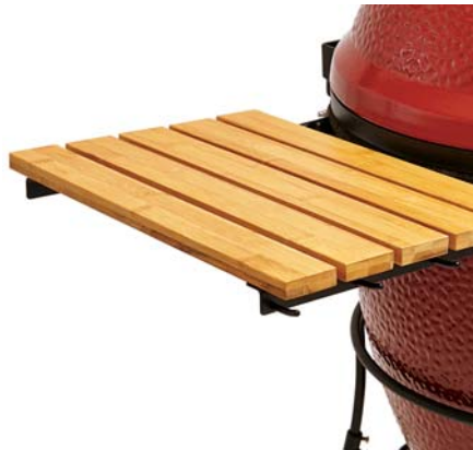
Finished folding bamboo side shelves