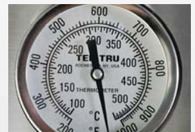
Extra-large thermometer for greater readability