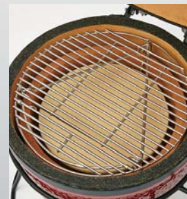
Full-size Heat Deflector for smoking, cooking with indirect heat