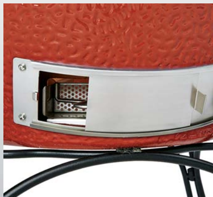
Stainless-steel sliding draft door