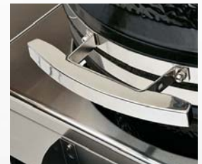
Stainless steel handle