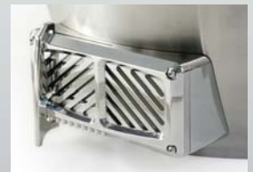
Investment cast 304 stainless-steel draft door with mirror finish