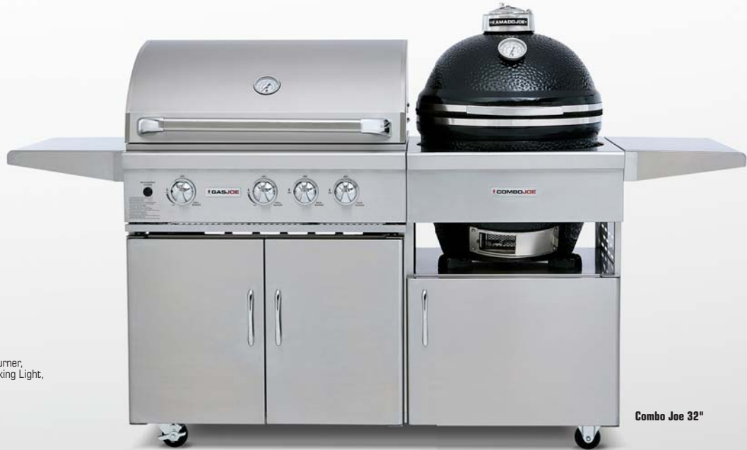
Combo Joe 32"