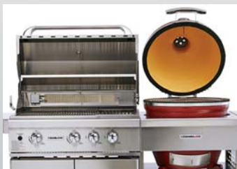
Combo Joe provides the best of all worlds combining a gas grill and a Kamado Joe ceramic grill in one