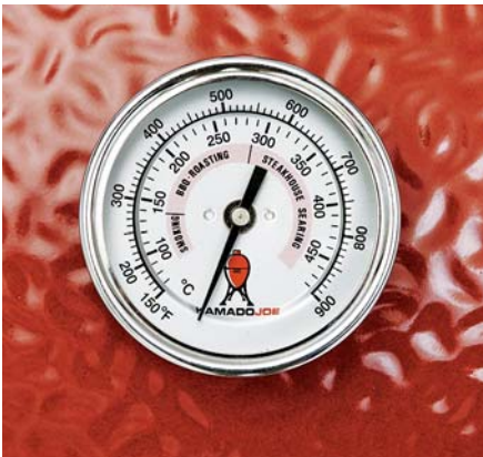
Extra-large, built-in thermometer for easy reading