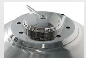
Investment cast 304 stainless-steel top vent with mirror finish