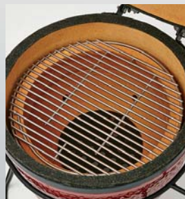
304 stainless steel grill grate with hinged opening for adding charcoal