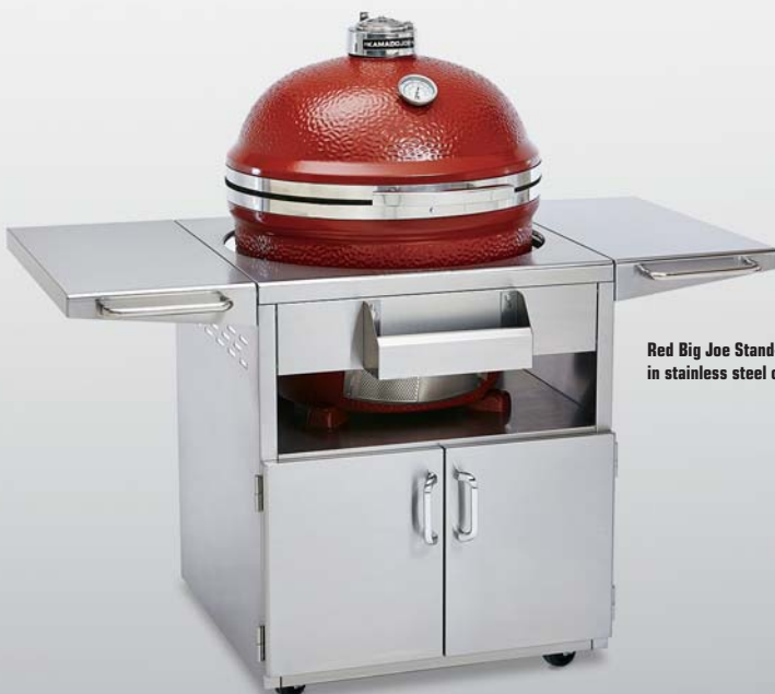
Red Big Joe Stand-Along 24" in stainless steel cart