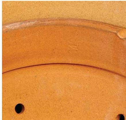
High-fire, heat-resistant ceramic