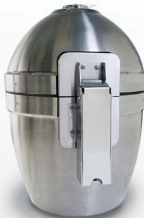
Perfectly counterbalanced hinge with static positioning as low as 10°