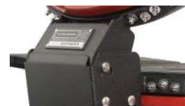
Air Lift Hinge